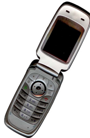
Fig. 2. Example of an image with acceptable resolution.